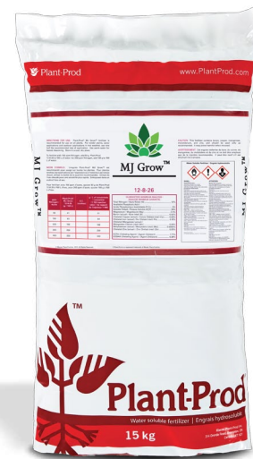
Plant-Prod MJ™ fertilizers are available in 15 kg bags.

Plant-Prod MJ™ Finisher will help with plant finishing when applied at 0.65 g per 1 litre (25 ppm N, 200 ppm P 2 O 5 ). The higher phosphorous and potassium will benefit the plants in their reproductive stage through to finishing. Switch to clear water 14 days before harvest.