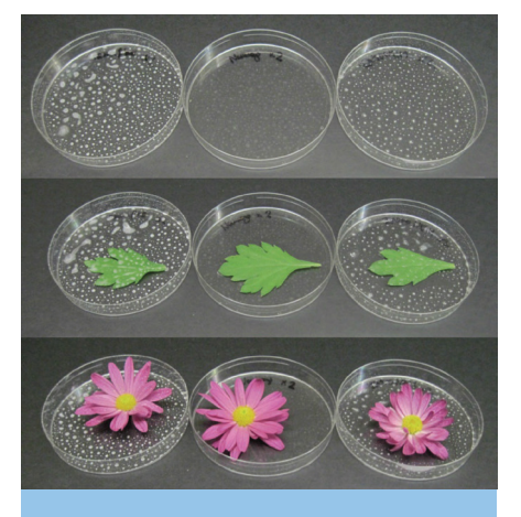
Assessment of foliar residues (Competitor A, Nemasys and Competitor B petri dishes at 5,000 IJ's per Litre and sprayed at a dose of 100ml of solution per m2).